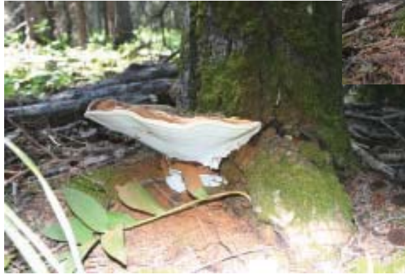
Third Place - Documentary - Ganoderma series by Martin Osis

members from both the Calgary and Edmonton areas. The weather was beautiful but what is good for forayers is not always best for the fungi. "However, some species were found, adequate to prepare an impressive fungal exhibit for people