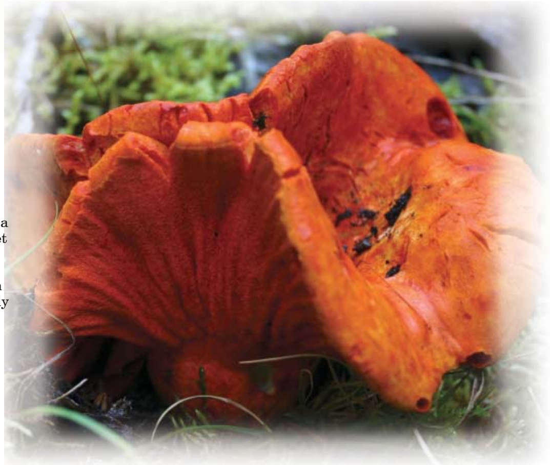
Hypomyces lactifluorum has the look of a lobster with its red exterior and white interior. This species is considered a choice edible by many.

There are a number of variables that need to be considered before assuming that the mushroom you have just picked is edible, especially the Hypomyces varieties. Because the parasite changes the shape of the mushroom and stops the growth of the mushroom’s normal spores, the identification process is extremely tricky. “The spores of the Hypomyces develop in small flask-shaped fruiting bodies called perithecium, which appears as