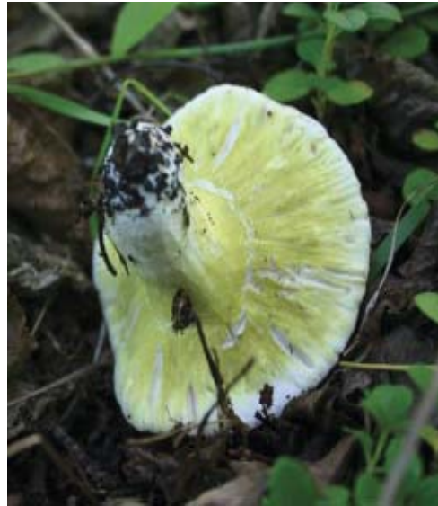
Hypomyces viridis on a host Russula. This parasite attacks the gills and stalk.

Hypomyces hyalinus is another in our group of "lobster" mushrooms. This species selects the Amanitas for its host. According to Rogers Mushrooms, this parasite can be found on Amanita rubescens , Amanita flavorubescens , A. frostiana